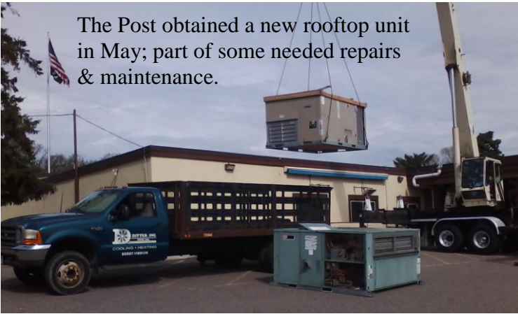
The Post obtained a new rooftop unit in May; part of some needed repairs & maintenance.

6501 Portland Avenue South, Richfield, MN 55423 (612) 866-3647 www.mnlegion435.org richfieldamericanlegion@comcast.net Jul/Aug/Sep 2013