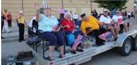
Members of Post 435 marching and riding in the Department of Minnesota Centennial Convention Parade in Rochester, MN.